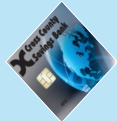
Visa® Instant Issue “Chip” Debit Card