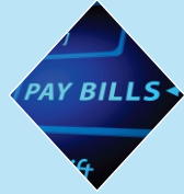
Online Banking with Bill Pay